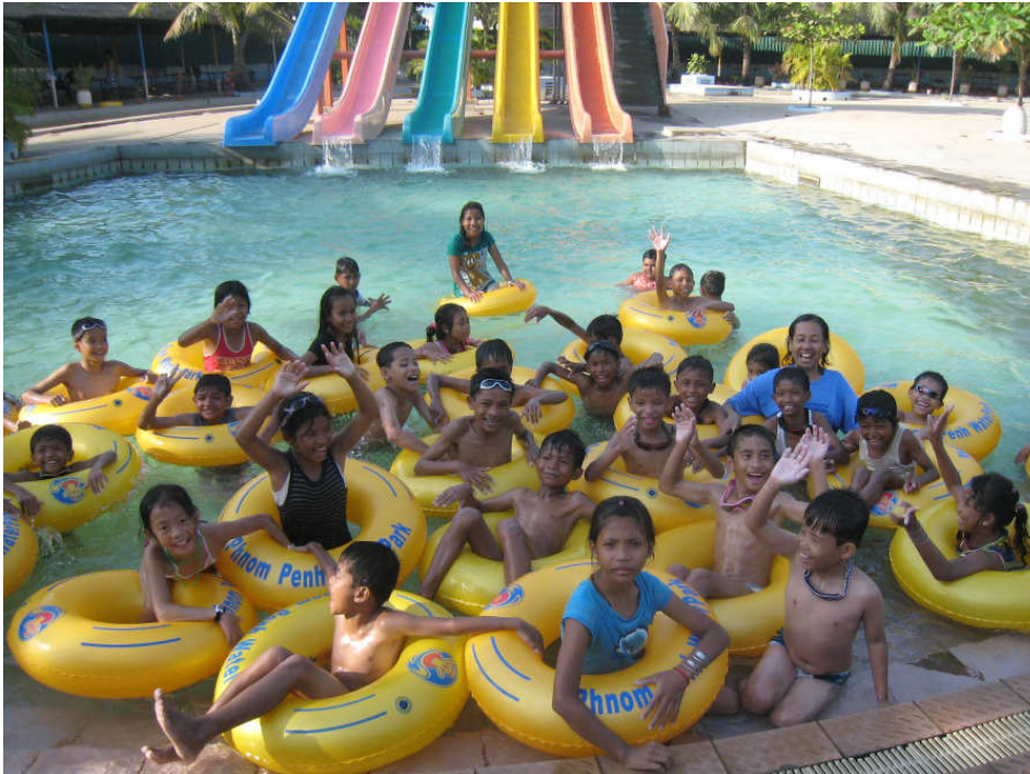
Roteang Orphanage kids enjoy the water park just outside of Phnom Penh.