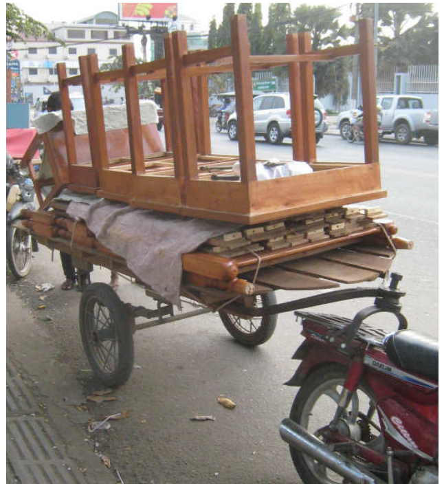
New furniture is made ready for delivery to the girls' dorm.

The farm program is in transition at present, as there are great amounts of construction going on in Phnom Penh City, and most of the men have left farming for construction jobs there, even though it means abandoning their families for months at a time and living on building sites. Pay for construction is about $4.50 a day, as opposed to the $2-3 a day one earns farming. We're left with only women to work the fields, which leaves us short when we need