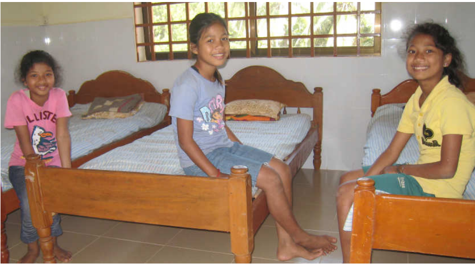
Three of the older Roteang Orphanage girls are delighted with their new dorm furniture.