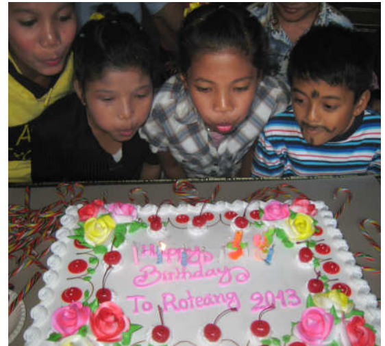
The annual birthday party is always a very special event.