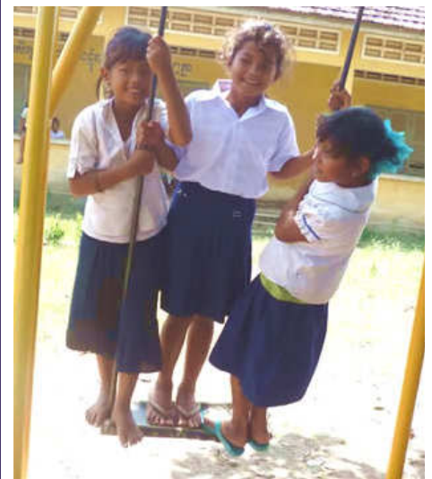
Beng Krom school girls love their new playground donated by TSF supporters.

While playgrounds in the US are frequently taken for granted, TSF was fortunate that donors from Ohio to Massachusetts to New Hampshire, saw the value in those play spaces, and initiated three unique fundraisers to make those new playgrounds a reality.