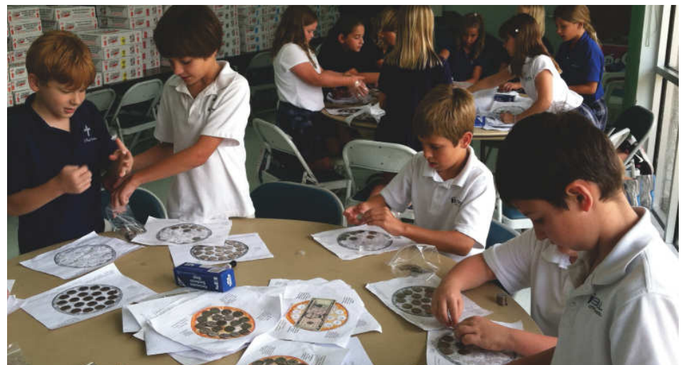
3rd graders in Florida make "pepperoni pizzas" to raise money for Roteang Orphanage furniture.