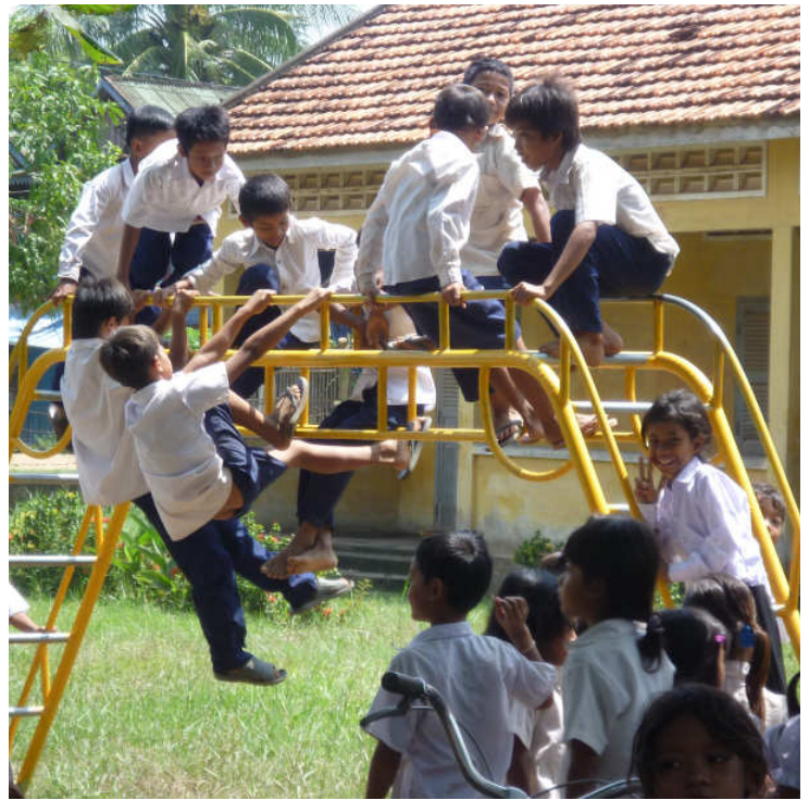
Happy Beng Krom school boys swarm over their new jungle gym, made possible by TSF supporters.

Up in the Greater Seacoast area of New Hampshire, a group worked together to make pennies add up for a playground. From the time their children were very young, a number of families with adopted children born in Cambodia gathered as a playgroup every month. As the kids grew and interests changed, the group stayed in touch, gathering when able,